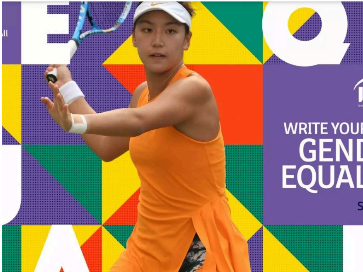
Image from the cover of the ITF Write Your Own Gender Equality Strategy document